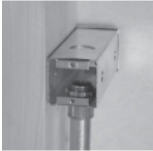
Mini Jbox by LumenArt