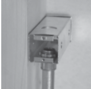
Mini Jbox by LumenArt