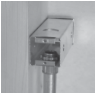
Mini Jbox by LumenArt