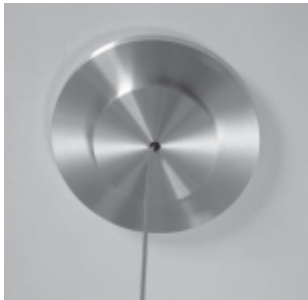
Optional 4" canopy