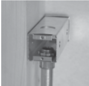
Mini Jbox by LumenArt